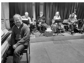
The Sydney Playford Players