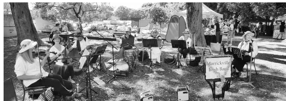
A group of Concert Party members playing as the Marrickville Bush Band performing at the Addison Rd Sunday Markets