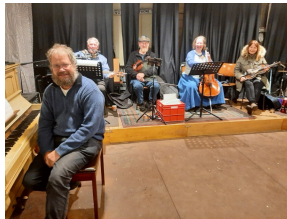
The Sydney Playford Players