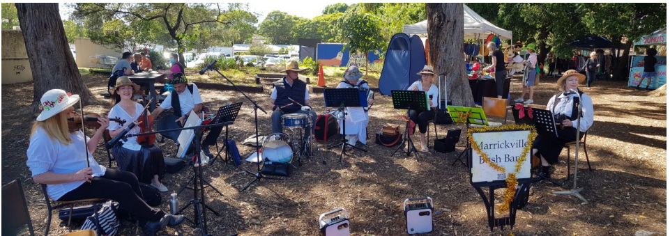
A group of Concert Party members playing as the Marrickville Bush Band performing at the Addison Rd Sunday Markets