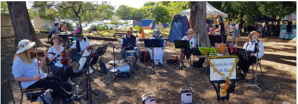
A group of Concert Party members playing as the Marrickville Bush Band performing at the Addison Rd Sunday Markets