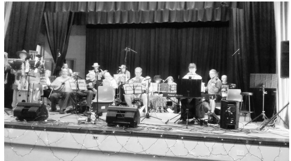
Concert Party will be playing for the Beecroft Dance in December.