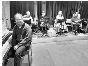
The Sydney Playford Players