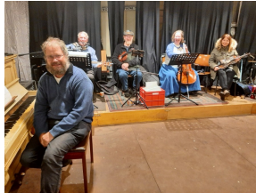
The Sydney Playford Players