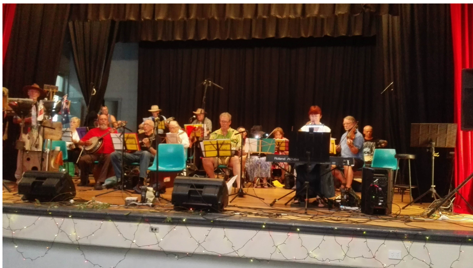
Concert Party will be playing for the Beecroft Dance in December.