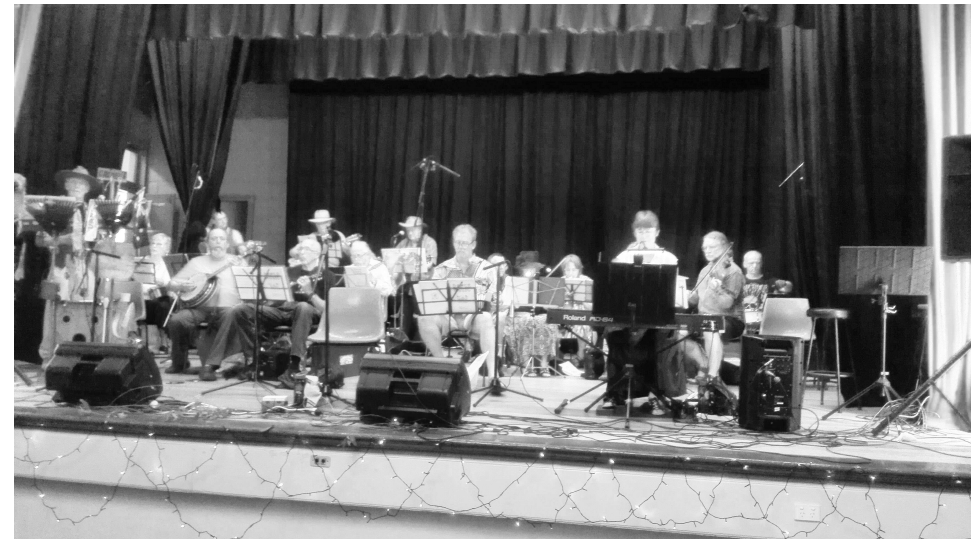
Concert Party will be playing for the Beecroft Dance in July.