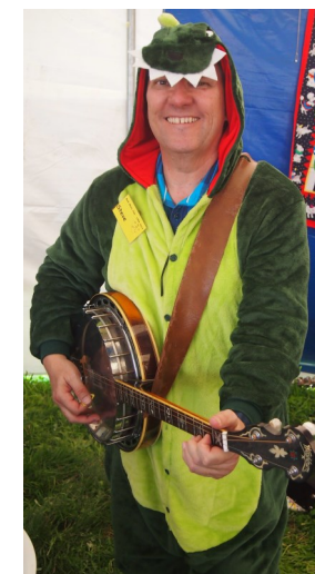
Frivolity in the Saplings Session at the National Folk Festival