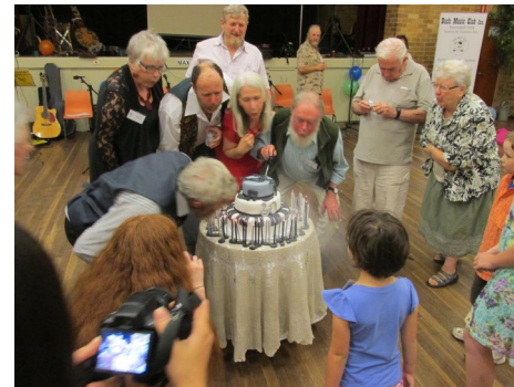
Presidents blowing out the candles.