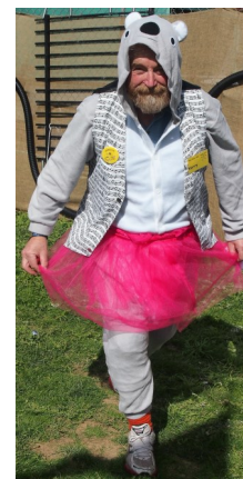
Special Edition 2014