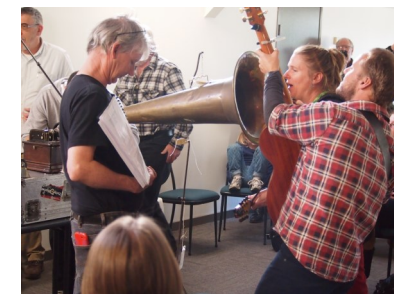
NLA wax cylinder recording at the NFF