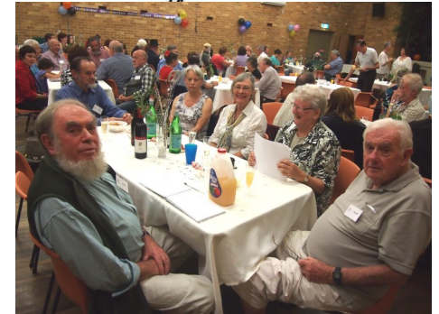
Anniversary Dinner - March