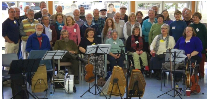
BMC and No Such Thing got together to teach each other their music.